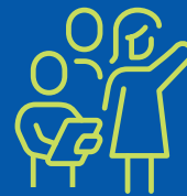
community and lifelong learning

Simply, that means we meet the person where they are at and design their supports from there, with them, their family and other natural supports. We ask questions and we take the time to listen and understand.