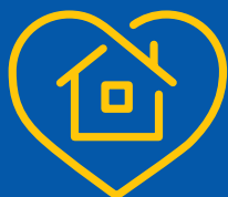
home and living

IDV will offer support to participants and deliver it in a holistic and integrated manner in the following three key areas of their lives